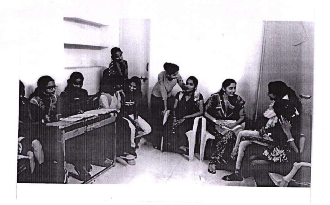
Student Rest Room